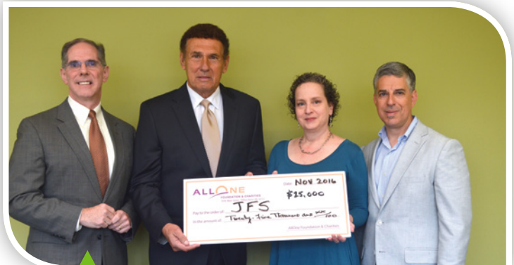
JFS was presented with a $25,000 check for the grant received by AllOne Charities for the Fall 2016 Grant Cycle. The focus of the grant was to assist expansion of outpatient behavioral/mental health counseling services to Lackawanna, Luzerne, Monroe, Wayne, Pike, Wyoming, Susquehanna, and Bradford Counties.