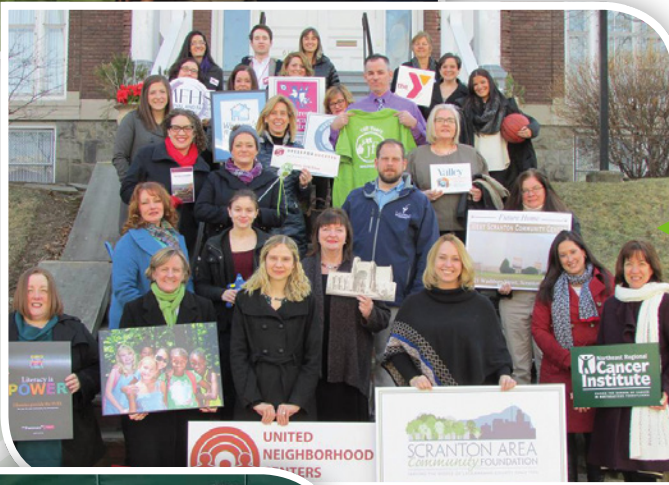
For the 2nd year JFS was proud to be a part of Scranton Area Community Foundation #NEPAMatchDay. JFS joined with 24 other local nonprofits, Match Day was held on May 5th, 2017.