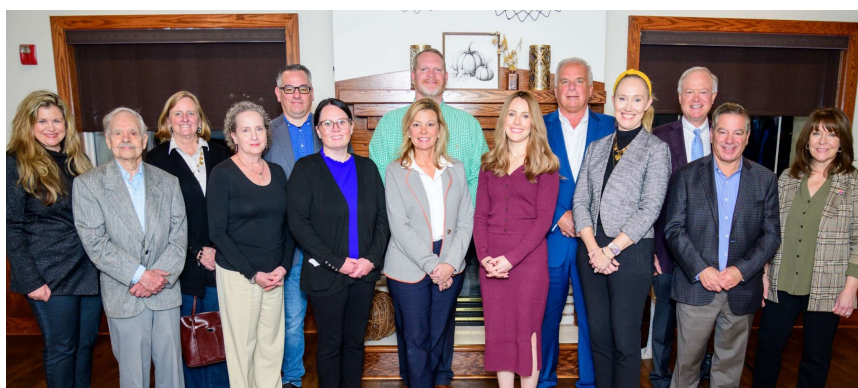
Northeastern Pennsylvania Health Care Foundation